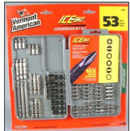
Vermont American 53 pc screwdriver bit set

The Board of Directors has agreed to fund the popular SSNA Attend & Win program through 2009. Started in 2005, the Attend & Win program encourages attendance at monthly meetings with prizes for attendees. At the last November SSNA meeting, a lucky neighbor on W. Ormsby won an 18V cordless Skil Saw. This month we are giving away your choice of one of the three prizes shown above. All attendees over 17 years of age are eligible to win! The drawing will be held at the end of Sunday's meeting.