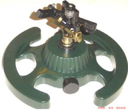
Metal Impulse Sprinkler covers up to 85 ft